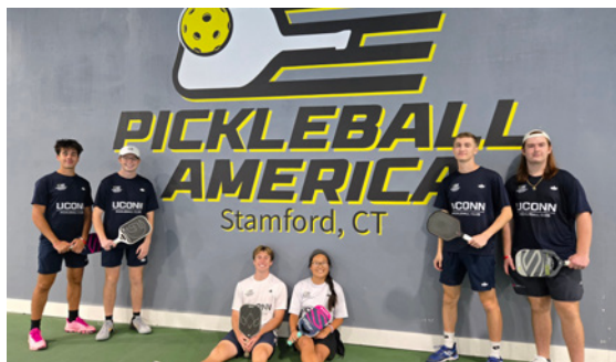
UConn Pickleball Club Team