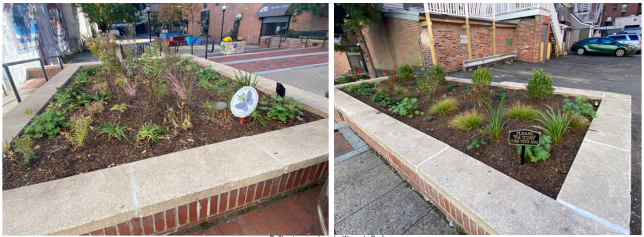
Pollinator gardens in Kiwanis Park