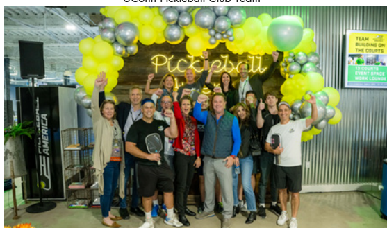
1-Year Anniversary Celebration