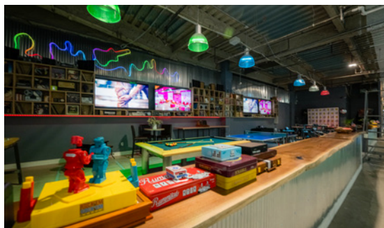
Hi-Fi Vinyl Listening Lounge