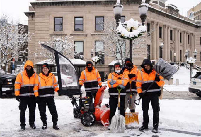
Stamford Downtown Ambassadors

As temperatures begin to dip, Stamford Downtown is preparing its response to winter weather events. Each year, Stamford Downtown works with the City of Stamford and Stamford Downtown’s business community to ensure a safe pedestrian environment during winter weather conditions. Safe pedestrian access throughout the public realm of Stamford Downtown is essential so that downtown businesses do not experience any disruption during stormy conditions.