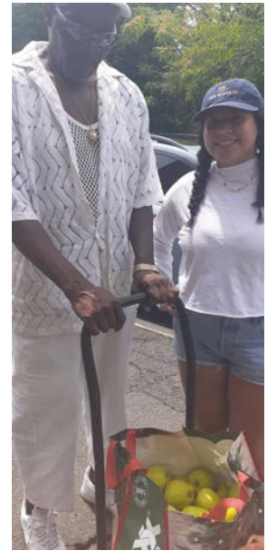
Food Rescue US - Fairfield County

This year through a partnership with Food Rescue US - Fairfield County and the Stamford Downtown Farmers Market, 600 pounds of fresh food was collected from our farmers and delivered to local food pantries. Food Rescue US engages volunteers to transfer fresh food surpluses from local businesses to social service agencies serving the food insecure.