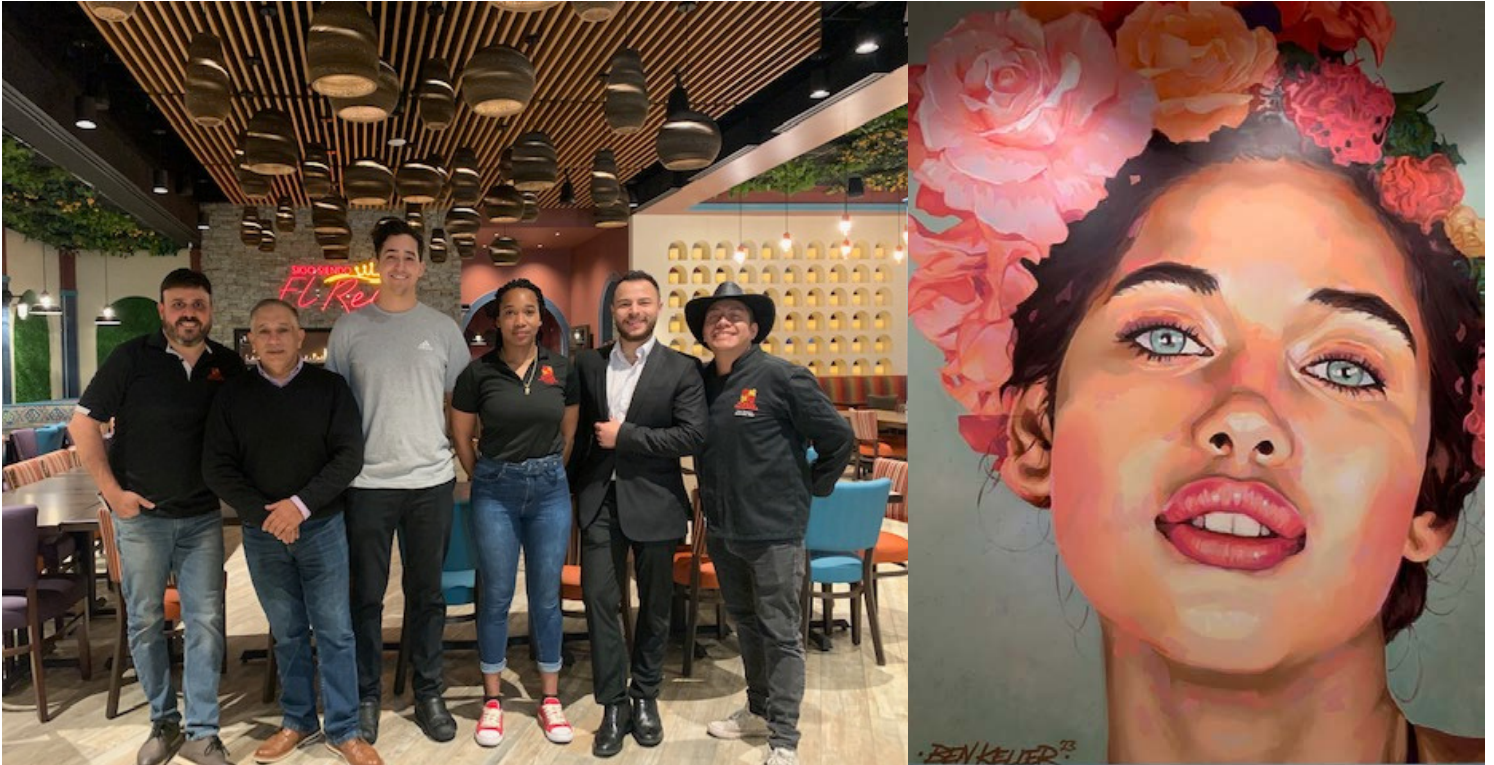
Puerto Vallarta Stamford Team