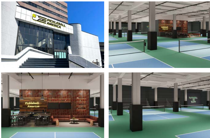
Renderings of Pickleball America at Stamford Town Center

Pickleball America will become one of the largest indoor pickleball venues in the world with 28 indoor courts, as it takes over an 80,000 square foot anchor space in the Stamford Town Center mall this summer. Once occupied by Saks Off 5th, the 2-story retail space will be rolled out in two phases – Phase 1 will begin immediately with the first floor (43,000sf), with the second floor (37,000sf) opening thereafter.