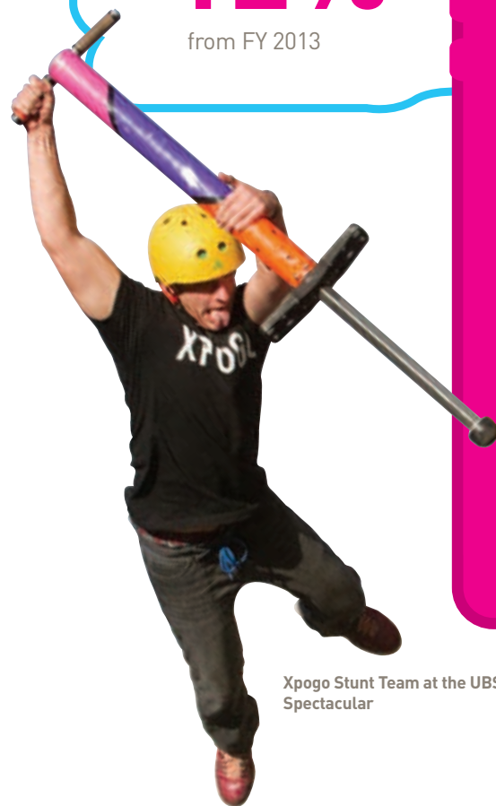
Xpogo Stunt Team at the UBS Parade Spectacular

Total number of people who viewed tweets or retweets mentioning @StamfordDowntown