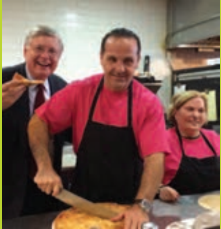
The Original Papa's Pizza