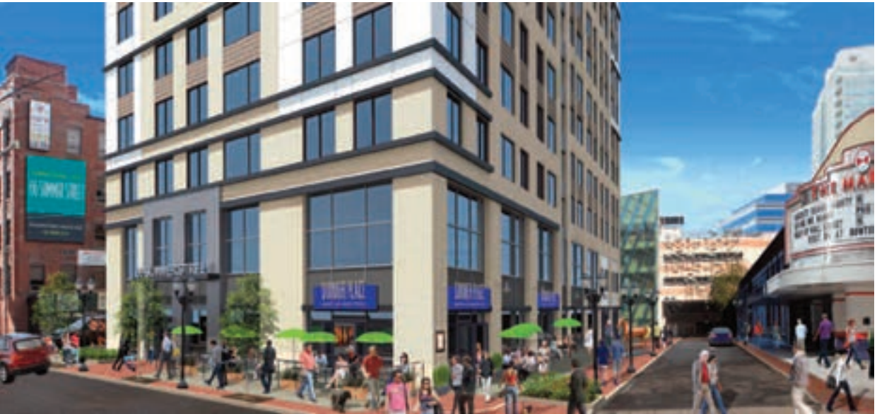
66 Summer Street

Active engagement in analysis of proposals for a new Transportation Center garage and private development as well as city and state plans to improve access, circulation and infrastructure in and around the complex.