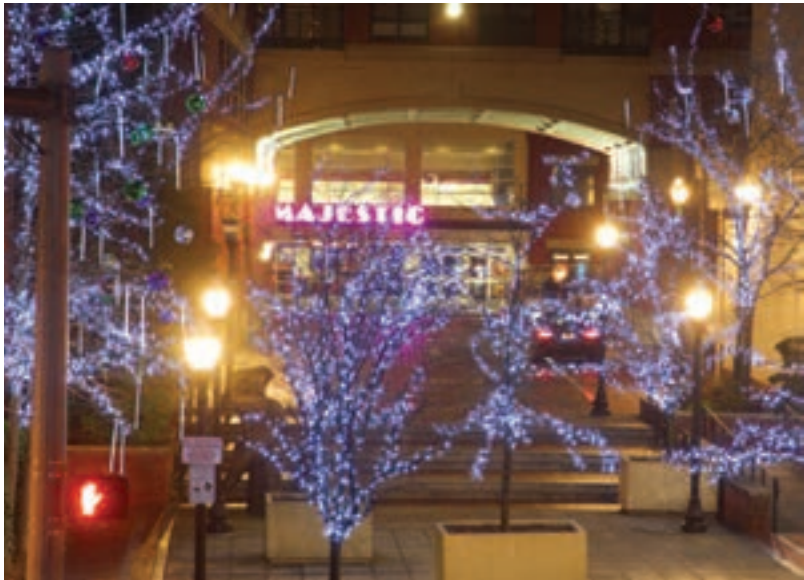
Holiday Lights in Stamford Downtown

Add interactive lighting feature to holiday and year-round lighting tableau.