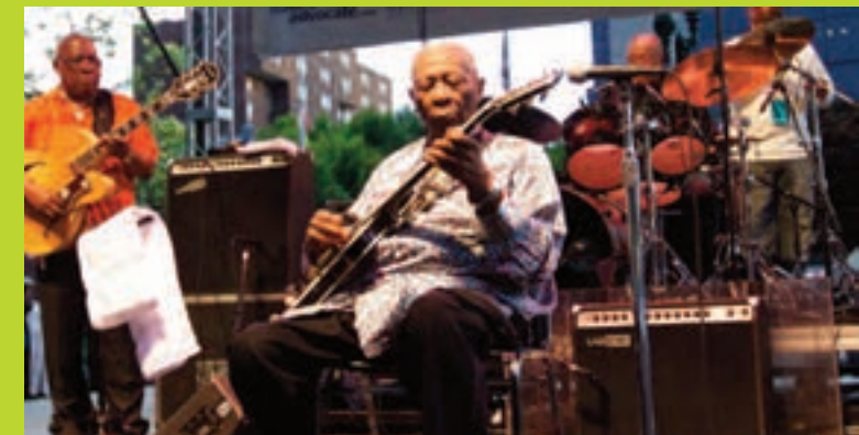
B.B. King at Jazz-Up July