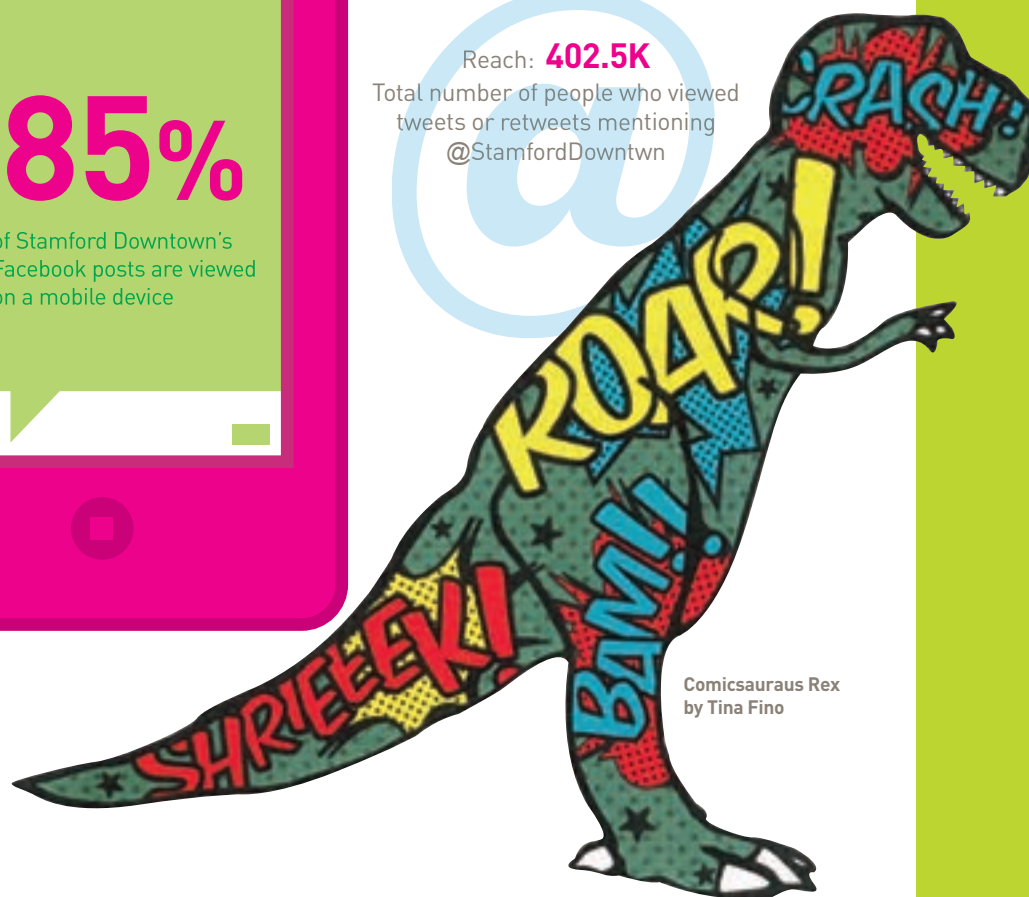
Comicsaurus Rex by Tina Fino