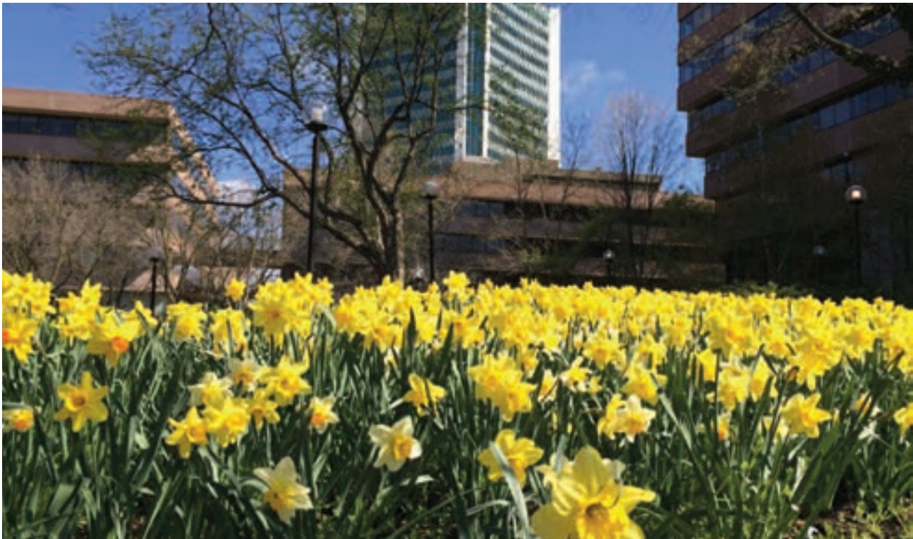
Spring in Veteran's Park