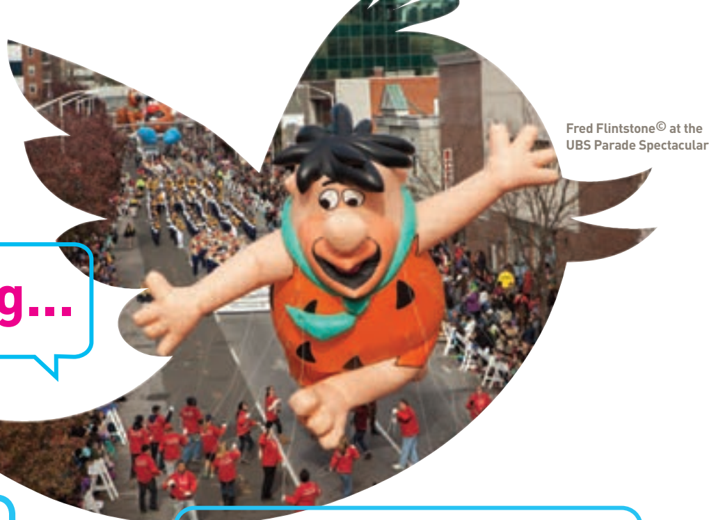
Fred Flintstone® at the UBS Parade Spectacular

1,465,390 Impressions: The total number of times Facebook users viewed content associated with Stamford Downtown's page