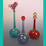
JG Glass Productions