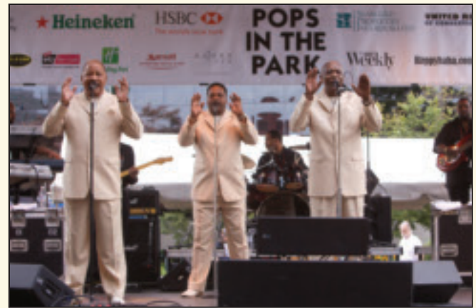
The Stylistics at Pops in the Park