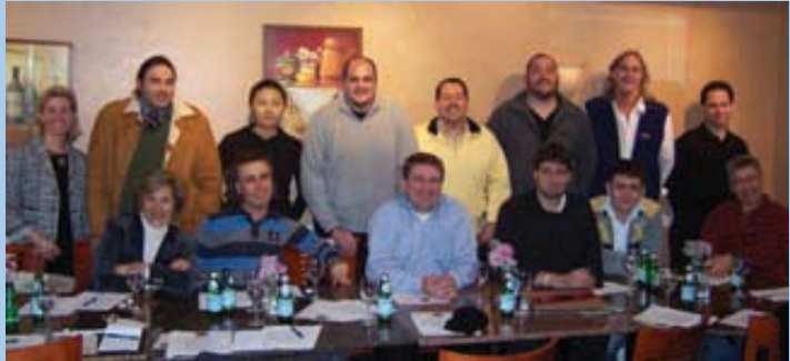
Stamford Tables Members at January 17 Meeting