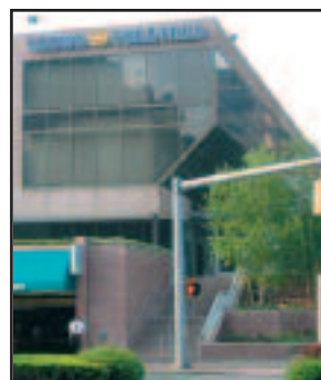
Crown Theatres new sign at Landmark Square

Be sure to stop by the newly improved Crown Landmark!