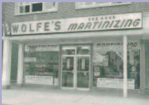
Wolfe's Circa 1955