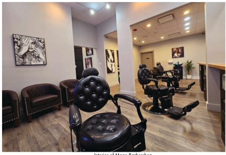
Interior of Mage Barbershop

Walk-ins are welcome, or to book an appointment, visit magebarbershop.com.