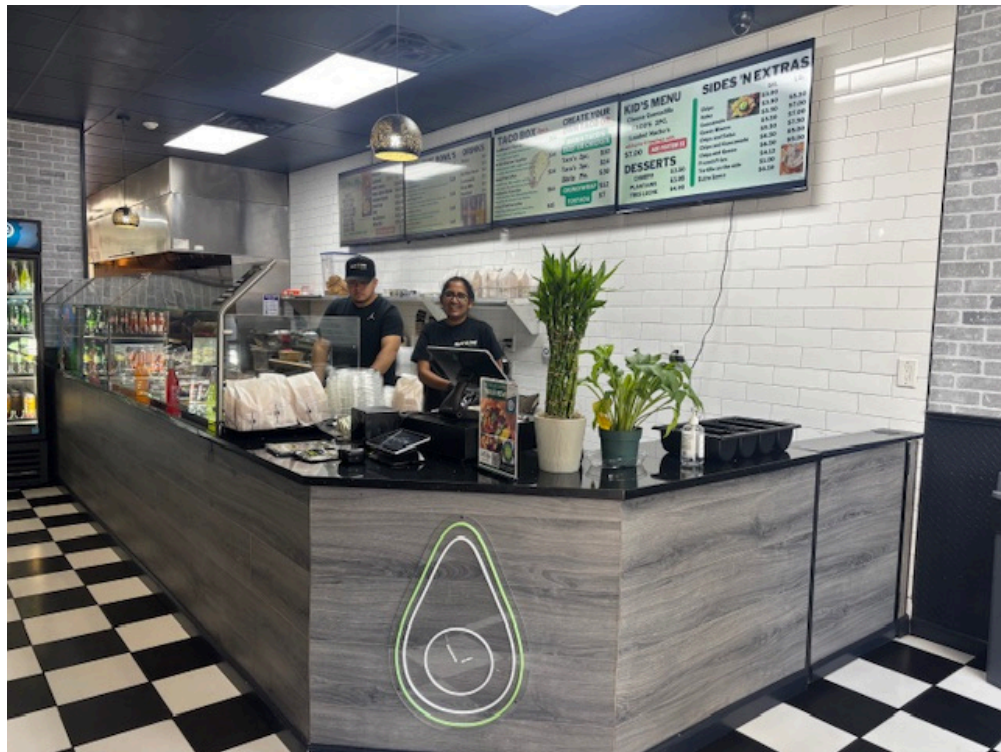
Guac Time Mexican Grill located at 459 Summer Street