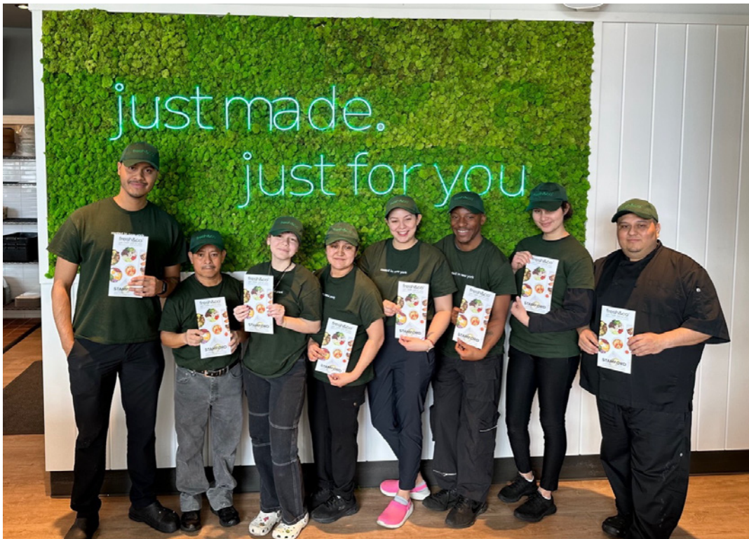
Some of the 25+ team members preparing just made, just for you - fresh offerings!