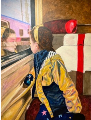
"The Train" by Rita Ghandour