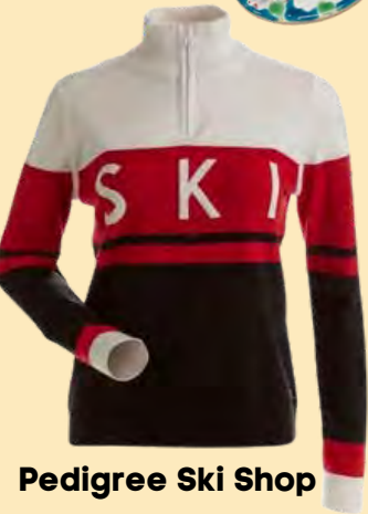
Pedigree Ski Shop