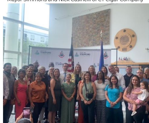
Grant recipients and Mayor Simmons

Mayor Simmons held a press conference on August 10, 2023 to recognize the local Stamford businesses that were awarded grants of $8,063 from the City's $1.5 Million American Rescue Plan Act (ARPA) funds. Over 250 Stamford businesses applied citywide and 176 small businesses were awarded the grants from the child care, tourism, restaurant and beauty industries. Of the 176 businesses, 30 are in Stamford Downtown and 120 business are women owned or minority owned businesses.