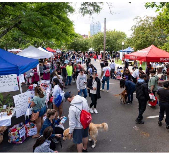
It has been a busy June! Visit Stamford-Downtown.com for more upcoming events.