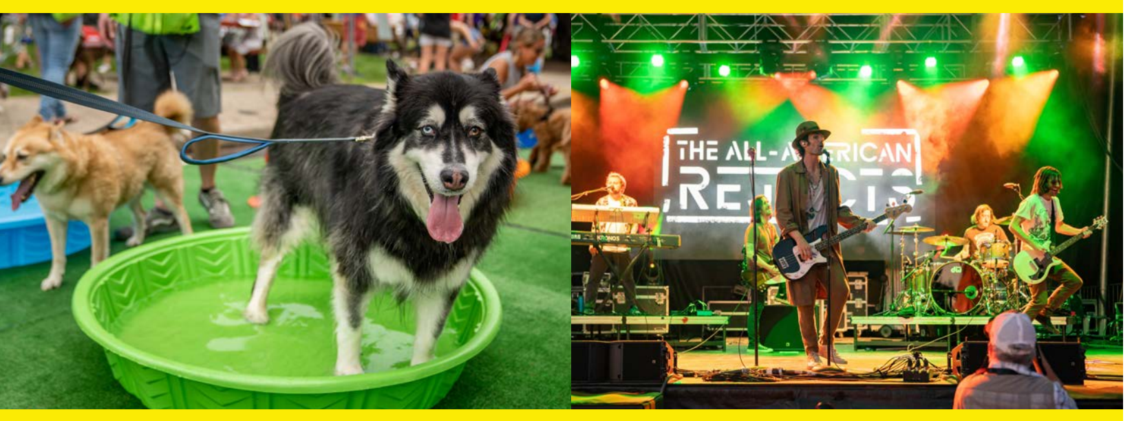
Bark in the Park

Goal: To produce dynamic events to draw visitors to Downtown and enhance the resident, worker, and student experience