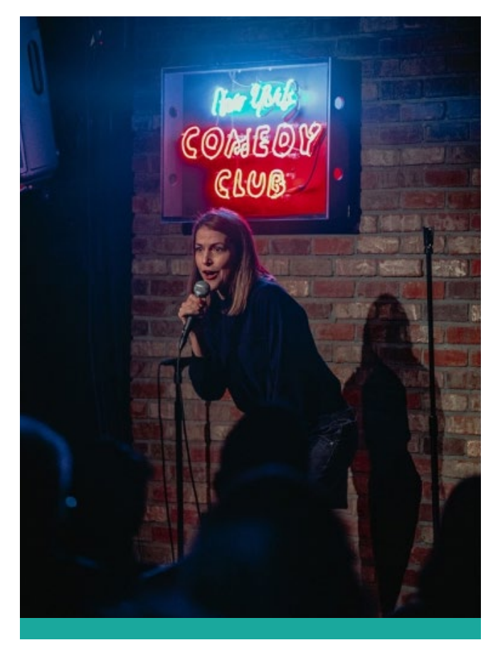
New York Comedy Club

In partnership with the CT Center for EcoTechnology, Stamford Downtown restaurants are working with a Waste Reduction Consultant to analyze their food operations and offer suggestions for implementing procedures to eliminate food waste.