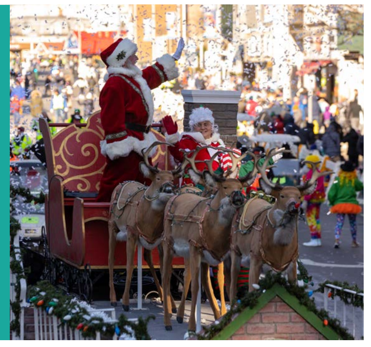
Stamford Downtown Parade Spectacular