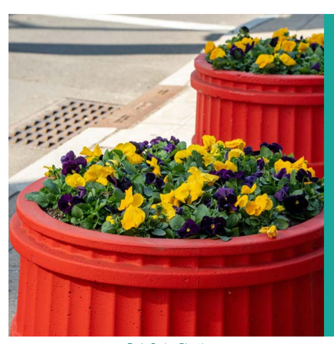
Early Spring Plantings