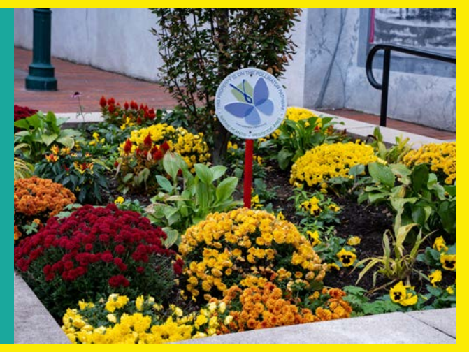
Pollinator Pathway in Kiwanis Park

viduals with available housing and mental health service providers. Stamford Downtown continues to build its working relationship with non-profit organizations serving vulnerable populations including Inspirica, Pacific House, Laurel House and Liberation Programs. Stamford Downtown is a member of the Coordinating Council of the Open Doors of Farfield County collaborative. Together, these providers offer a continuum of care including mental health treatment, job and housing placement, and emergency shelter and subsidized affordable housing options.