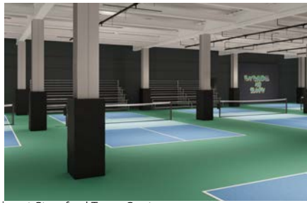
Renderings of Pickleball America at Stamford Town Center

Pickleball America will become of the largest indoor pickleball venues in the world with 28 indoor courts, as it takes an 80,000 square foot anchor space in the Stamford Town Center mall this summer. Once occupied by Saks Off 5th, the 2-story retail space will be rolled out in two phases - Phase 1 will begin immediately with the first floor (43,000sf), with the second floor (37,000sf) opening thereafter.