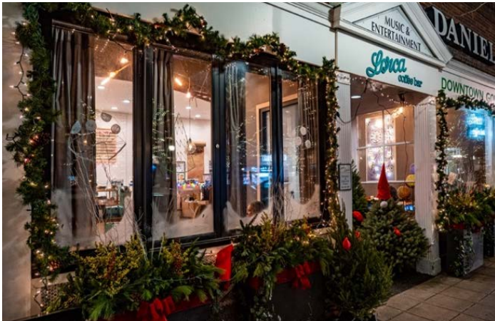
Best of Show – Lorca Coffee Bar at 125 Bedford Street