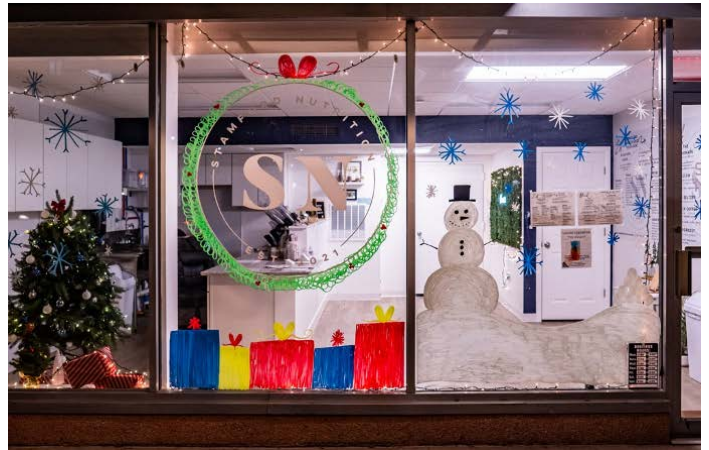
Honorable Mention – Stamford Nutrition at 117 Broad Street

In the spirit of the holiday season, Stamford Downtown was delighted to host its 12th annual storefront facade decorating contest known as "Deck the Downtown" showcasing 27 Stamford Downtown businesses. The public was enthusiastically voted on Stamford Downtown's website through December 18th and the votes have been tabulated.