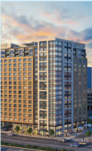
VELA ON THE PARK

First quarter 2018, saw the addition of two new residential apartment buildings adding over 20,000 square feet of street-level retail space and 534 residential apartments to the robust inventory of 7, 521 residential units in Stamford Downtown.