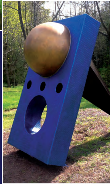
Turning Point Wayne Vaughn

• A Stamford Downtown Outdoor Sculpture Exhibit •