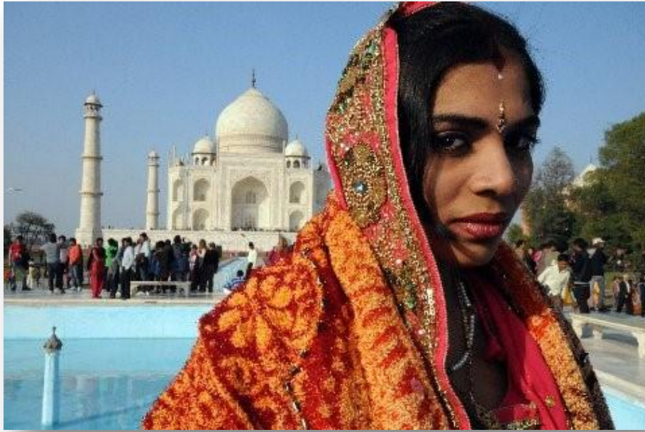
Women at Taj