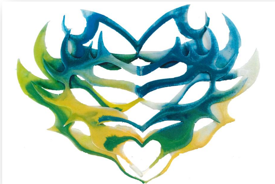
Heart Mess Jane Coco Cowles Digital Illustration