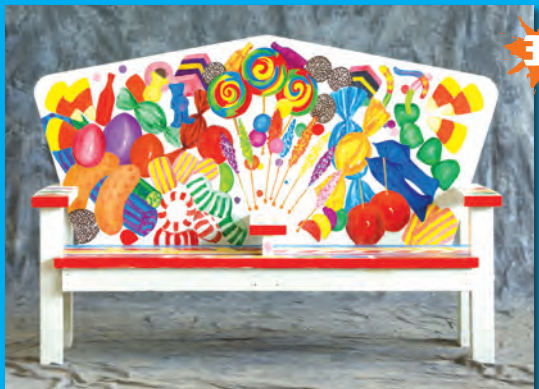
SWEET SEAT ANNE SALTHOUSE SPONSORED BY BAR ROSSO