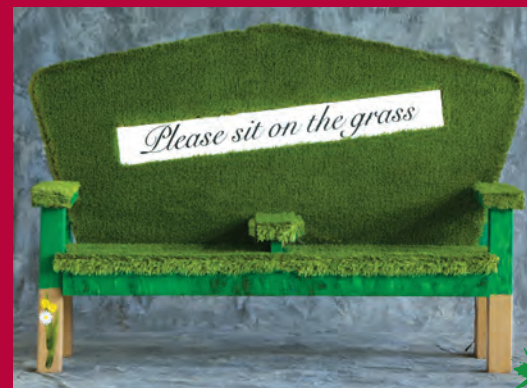
PLEASE SIT ON THE GRASS NINA BENTLEY SPONSORED BY HUDSON GRILLE