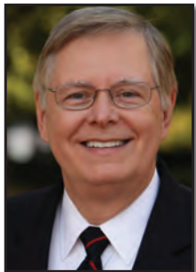
David Martin Mayor City of Stamford