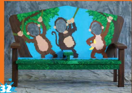
MONKEYING AROUND DIANA ORBANOWSKI SPONSORED BY NBCUNIVERSAL