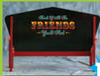
RELAX YOUR FEET TINA FINO SPONSORED BY RECKSON, A DIVISION OF SL GREEN REALTY CORP.