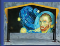
STARRY BENCH VALESKA DUDLEY SPONSORED BY EMPIRE STATE REALTY TRUST