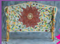
FLOWER POWER SHELITA BIRCHETT BENASH SPONSORED BY SEABOARD PROPERTIES, INC.