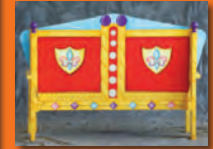
SITTING REGAL KIMBERLY MIRABITO SPONSORED BY GRADE A SHOPRITE