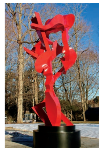
Navigator by Kevin Barrett

For more information or a map of exhibit locations, please call Stamford Downtown at 203-348-5285 or check our website at stamford-downtown.com in mid-May.