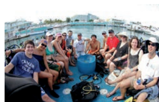
Divers enjoying one of the many dive trips Oceanblue Dive offers every year