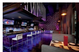
The Bar at Kashi Japanese Cuisinet