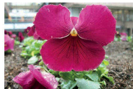
One of 2,500 pansies planted Downtown

Every year we're hard pressed to decide which sign of spring is our favorite. Is it the 2,500 pansies that are planted throughout the district by our volunteer Garden Groomers? Or is it the 56 sidewalk cafés that sprout on the sidewalks bringing with them a renewed sense of excitement and vitality? Fortunately, we don't need to choose; we can simply enjoy both together as we explore the vast array of fabulous restaurants on every downtown street.