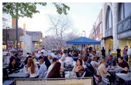
Downtown diners enjoying the outdoor patios

Sidewalk cafes are a key element of the vibrant downtown restaurant scene and we celebrate them throughout the season. But it's also important that they are a positive experience for all visitors, so this year expect some minor changes. We've worked with city staff and elected officials to ensure downtown sidewalks will be comfortable to maneuver for moms with strollers, those with disabilities as well as any other special needs.